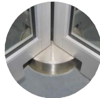
Close-Up of Collapsing Mechanism

All Specifications are Subject to Change