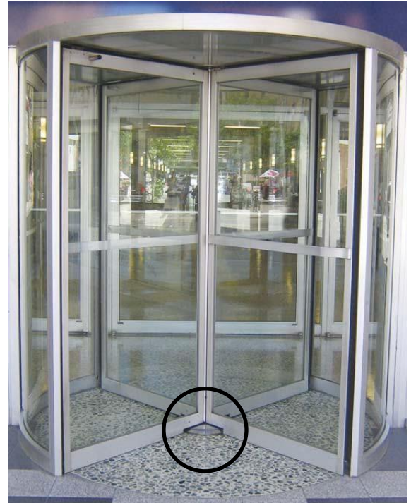
CJ Rush 500 Series Revolving